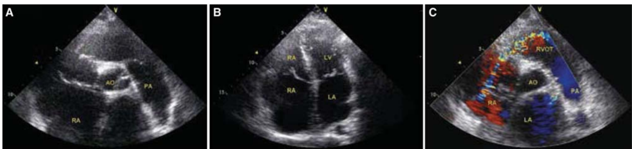
Figure 2. (A) Transthoracic echocardiographic short-axis images showing increased tissue density in the right ventricle and (B) significant dilatation in the right heart chambers. (C) Color Doppler image suggesting narrowness in the right ventricle due to increased tissue density.

monstrated by transesophageal echocardiography. Congenital heart pathologies were excluded by transthoracic and transesophageal echocardiography, while MRI confirmed the present findings with increased tissue density in the right ventricle and significantly dilated right atrium (Figure 3). The right ventricular pressure was measured as 92/13/20 mmHg (systolic/diastolic/enddiastolic) during right heart catheterization. However, measurement of pulmonary artery pressure was discontinued when the patient developed monomorphic ventricular tachycardia while advancing the catheter through fibrotic tissue which led to narrowness in the right ventricle. Right ventriculography also demonstrated narrowness in the right ventricle. Infiltrative diseases, storage diseases, conditions leading to endocardial involvement (history of hypereosinophilic syndrome, drug use, and radiation, etc.), familial cardiomyopathy, collagenous tissue diseases and diabetes mellitus, which may be among the reasons for restrictive cardiomyopathy were excluded by transthoracic and transesophageal echocardiography, MRI, upper abdominal ultrasonography and laboratory analysis.